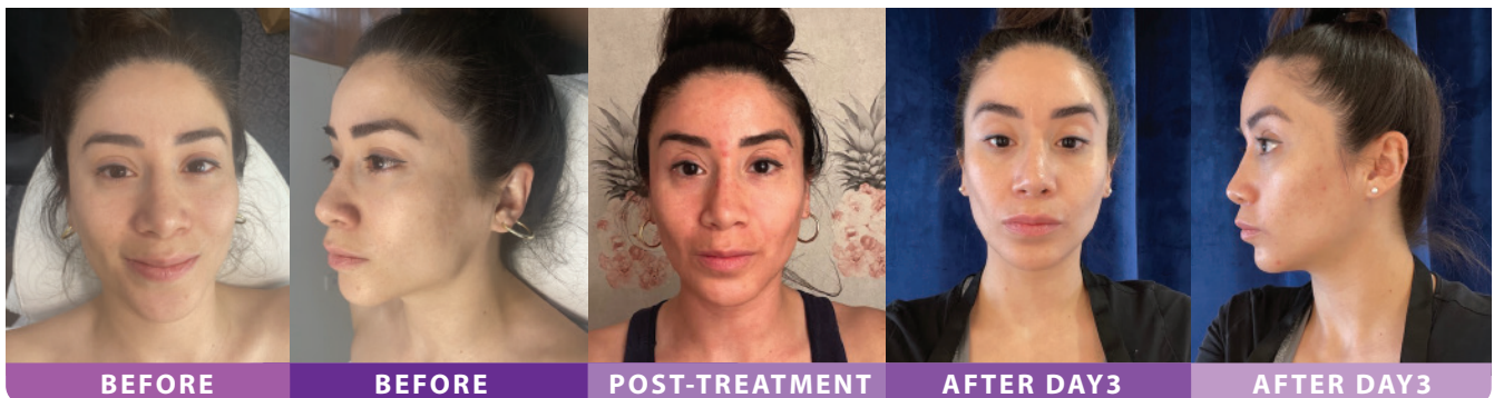
PATIENT: AGE 32, SKIN TYPE 4 TREATMENT: REJUVAPEN TREATMENT DESIRED RESULTS: COLLAGEN PRODUCTION, RESURFACING, SCARRING