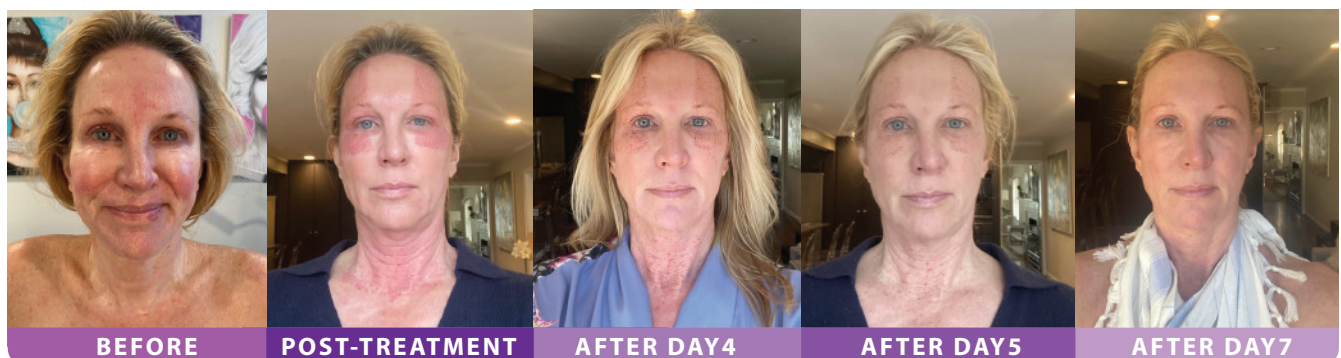
PATIENT: AGE 59, SKIN TYPE 2 TREATMENT: PHOTOFACIAL, PLASMA PEN TREATMENT DESIRED RESULTS: FIBROBLASTING AROUND EYES, RESURFACING