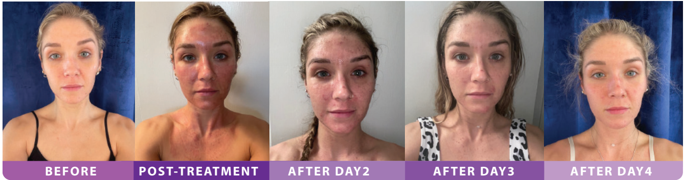
PATIENT: AGE 32, SKIN TYPE 3 TREATMENT: MORPHEUS8 TREATMENT DESIRED RESULTS: SKIN TIGHTENING, RESURFACING, ACNE